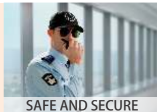
SAFE AND SECURE

Your safety and security is our utmost concern. Bounded by a sturdy compound wall, and 24/7 security guards on the prowl. Sizzle JR Elite ensures you feel safe at all times.