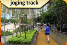
Park with joging track