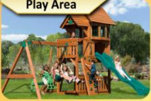
Childrens Play Area