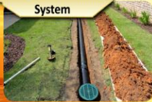
Underground Drainage System