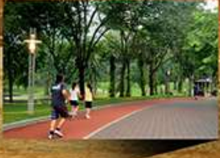
Park with Jogging track