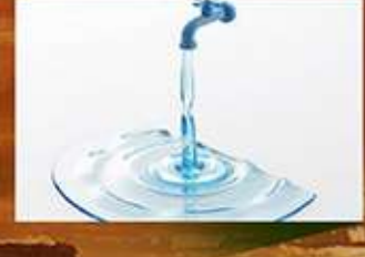
Storm Water drains & Water Facilities